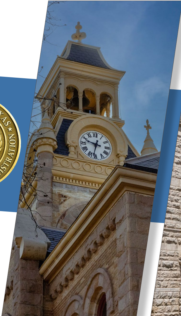
Llano County Courthouse