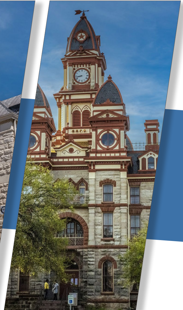
Caldwell County Courthouse

OFFICE of COURT ADMINISTRATION, TEXAS JUDICIAL COUNCIL