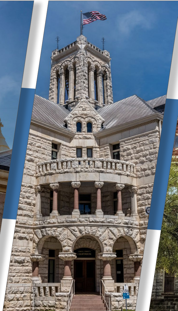
Comal County Courthouse